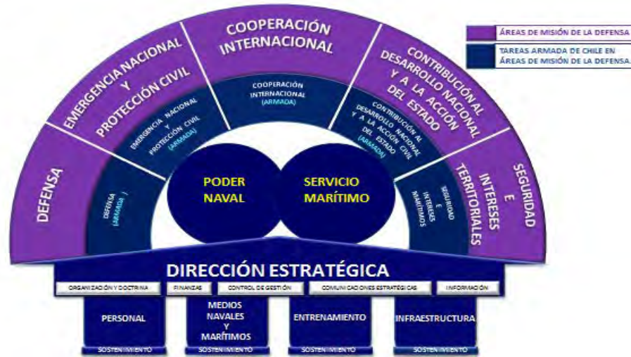
Mission areas and Chilean Navy tasks as defined by the Ministry of Defense in LDN 2017 115

As a final detail of this section, the Chilean Navy ranks 5th in the acceptance by the Chilean population in the survey that measures public opinion on different fronts. 116 It comes after the radios, Investigations Police (Policia de Investigaciones – PDI), Airforce and Civil Registry. This leverage is something that the Armada can use when necessary, but also it only takes one big mistake to lose your position in the ranking. The navy needs to better understand the way this survey works so it can understand the consequences of its actions. What makes you go down can be obvious, but what makes you improve and the value of better positions is something that needs more understanding. 117