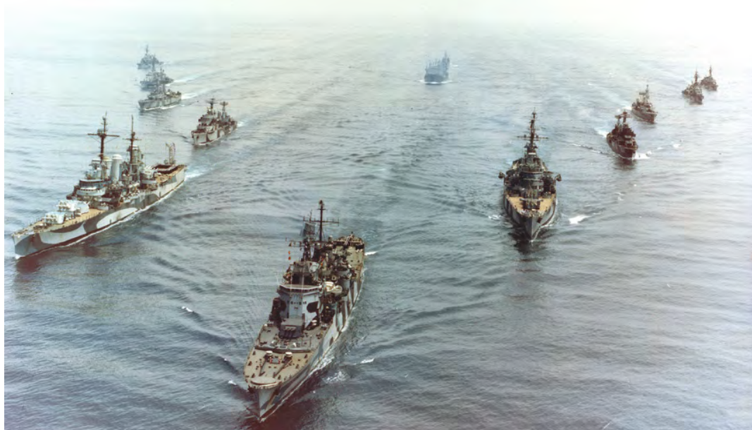
The Chilean Navy Escuadra that went south to defend Chilean sovereignty in the Beagle Channel December 1978 49

readiness of the Chilean forces. The Chilean fleet had the advantage of its positions in the Chilean fiords south of Punta Arenas and good information of the whereabouts of the Argentine fleet. This was provided by naval aviation assets that operated out of Punta Arenas. More than once the fleet went to encounter the Argentine ships, the last occasion being on December 22nd 1978. After that the Argentine fleet left the area and went back to its base port in Puerto Belgrano. 46 The Argentines although having a better fleet that included the Aircraft Carrier 25 de Mayo , did not have the advantage Chile had of its protected berthing in the fiords and suffered greatly from the bad weather of the South Atlantic. There is doubt whether bad weather prevented the conflict or if it was the acceptance of the mediation of the Pope that saved both countries going to war, but in the case of the Chilean Navy and the generation that manned the ships at the time, this is considered a quasi-victory and shaped the minds of generations, whether they were present on-board, or by means of the war fighting narrative of the navy. Recently the Armada was handed a work of several years that documented the experiences of the ones that participated and were present in the Beagle in 1978 before they get too old. 47 This documentary is now going public and the press has used it to reinforce the role of the navy and the fact that its presence and determination prevented conflict. 48