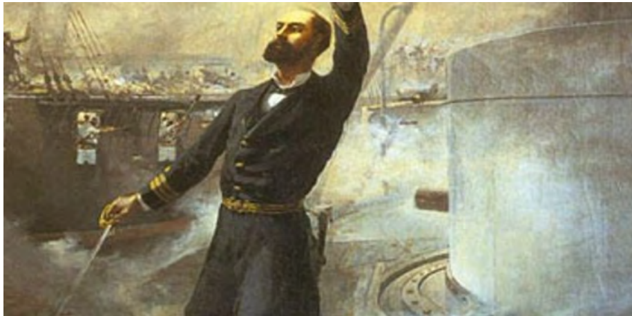
Capitan de Fragata 'Arturo Prat Chacon' being shot after boarding the Monitor 'Huascar', Peruvian Navy, in the Iquique Naval Battle, May 21 st 1879 9

The Chilean Navy is an institution that values its past and celebrates its history in a very active way, its highlight being the commemoration of the Naval Battle of Iquique that took place on May 21st 1879 6 and in the example set by notable captains such as Arturo Prat 7 as role models of the naval officer that the Chilean Navy expects all graduates of the Escuela Naval to follow. The past establishes the values that are the foundations of the Chilean Naval culture and purpose. This culture establishes the way an institution works, what is important, and at the end of the day, sets the limits of what can be done and the limits of the adaptive capabilities that are needed to engage the future. 8 The Chilean Navy sees itself as a war-fighting navy and has its roots in its first successful century of life. This resultant sense of purpose is part of its DNA and drives much of what it does.