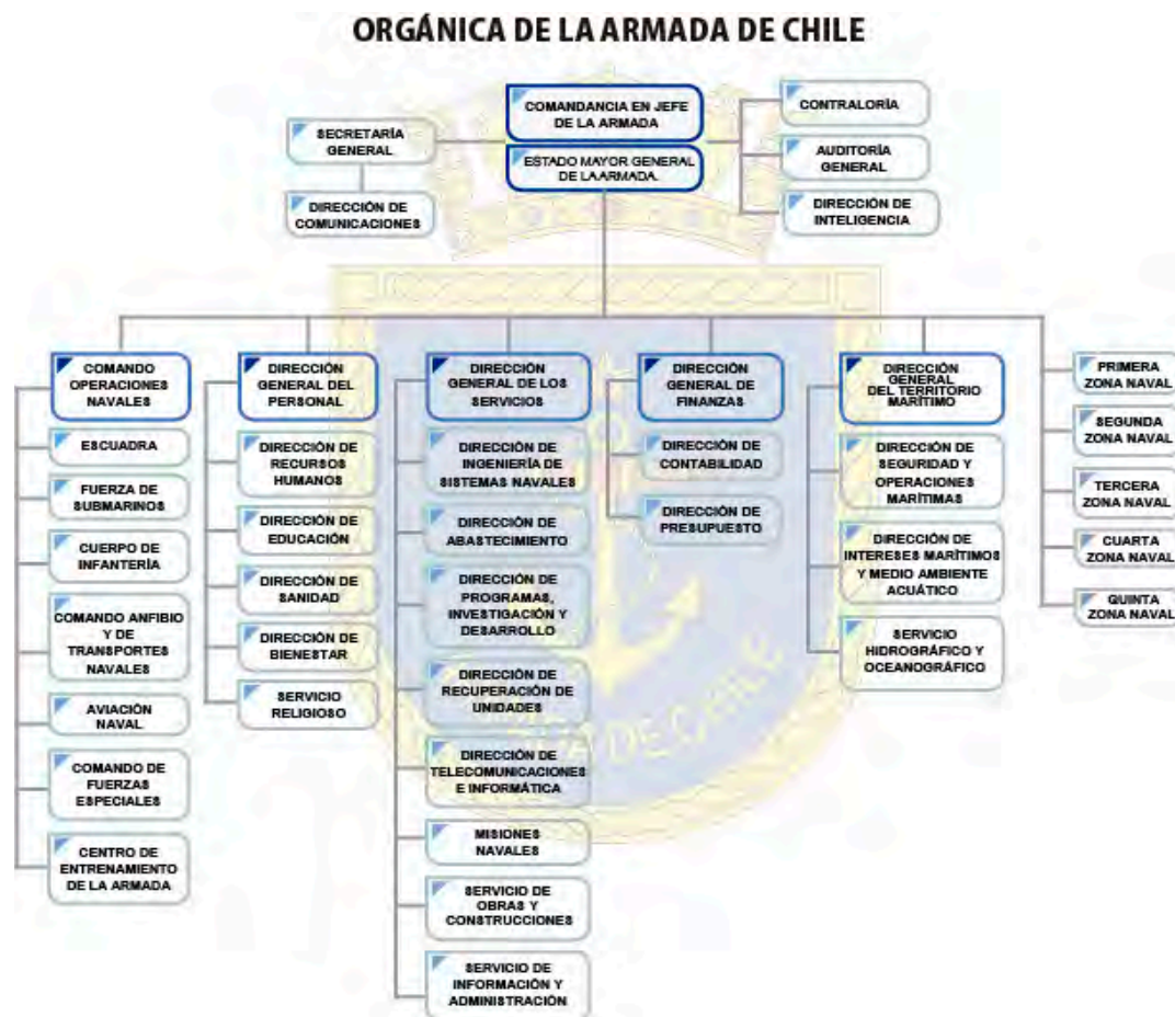
86 Chilean Navy Organisational Chart 2018

The maximum authority of the Chilean Navy is the 'Comandante en Jefe de la Armada' (CJA). He is a 4-star admiral who is selected by the President of the Republic of Chile every four years from the five most senior vice admirals, as selected by the CJA since he proposes to the President and the Minister of Defence the rear admirals who should be promoted to vice admirals and the admirals who should retire. 87 CJA has complete authority over the navy 88 except in case of war or emergencies where he has to hand over the operational forces to the 'Jefe Del Estado Mayor Conjunto' (JEMCO). This is the Chilean version of a Chief of the Defence Staff. Having said that, in a peace time navy this handover of power only happens when troops are sent on a peacekeeping operation or there is a state of emergency that requires naval forces support.