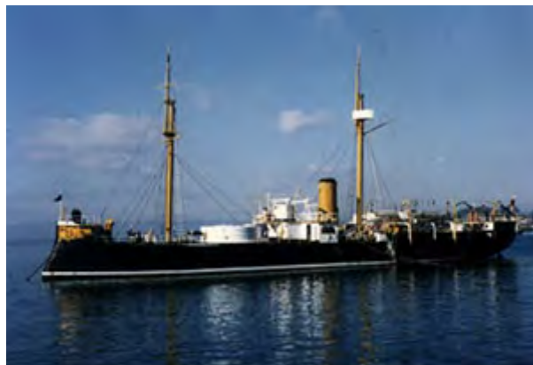
The Monitor Huascar in its present condition as a floating museum based in the Talcahuano Naval Base 28

to capture the Huascar and prevent it being scuttled. 26 The Huascar is still in the hands of the Chilean Navy and is a floating museum based in the Naval Base of Talcahuano. 27