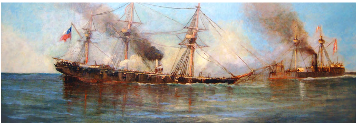
'Combate Naval de Iquique, 21 de Mayo de 1879' – Iquique naval battle, May 21st, 1879 1